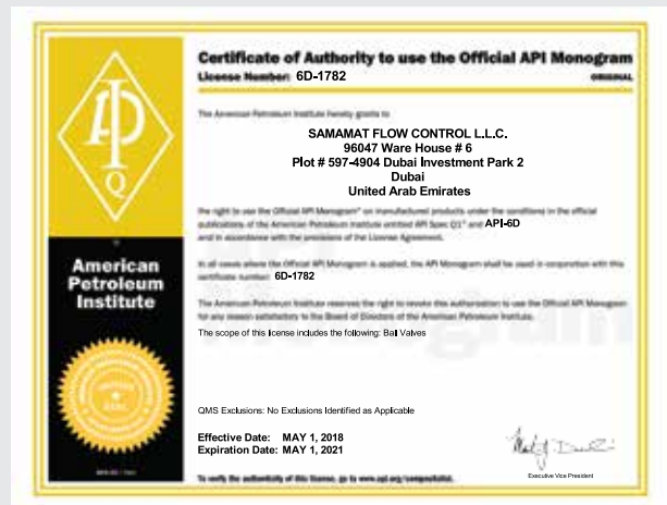
API 600 - GATE VALVES