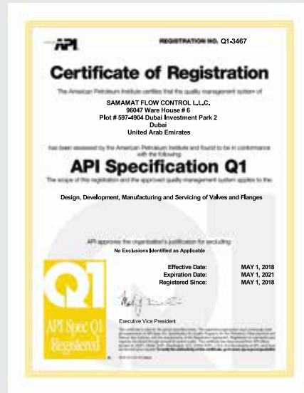
API SPEC Q1