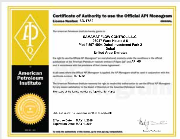
API 6D - BALL VALVES