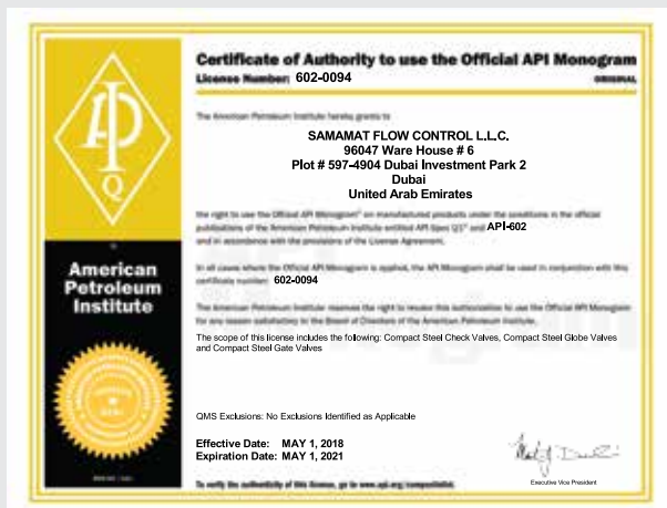
API 602 - FORGED GGC VALVES